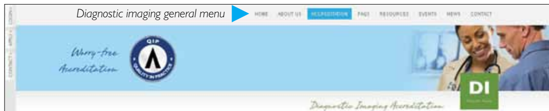
Figure 2: Inner diagnostic imaging page

The top menu listed below in figure 2 illustrates the inner diagnostic imaging page. Each section of the top menu has more specific information and detailed menus on these topics. See Figure 3 below for an example of the 'Accreditation' section of the website.