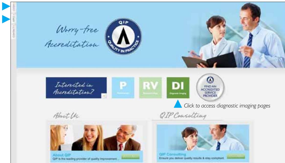
Figure 1: Service provider login

T: 1300 888 329 F: 1300 362 110 E: info@qip.com.au